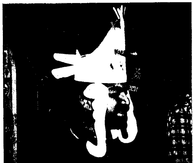
... the hats got more and more bizarre