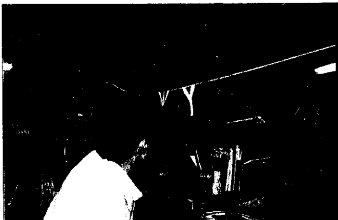
Price of admission . . .