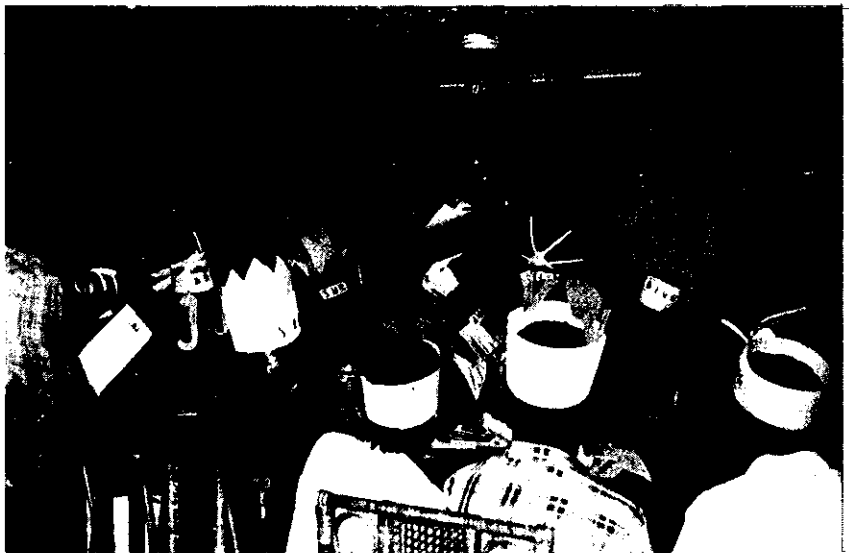
Game 1-- "My name is panda, rhino, antelope, vulture, ibex, nilgiri langur ... sis, snort, snuff, cackle, screech, screech, hoo."