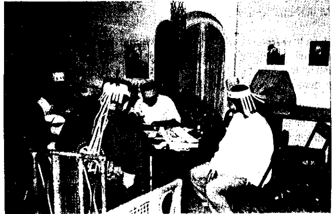
Price of dinner ...

Everyone went home for awhile and came back. When they returned, each person was given a piece of paper and scissor and made to cut out one letter contributing to the big HAPPY NEW YEAR 1997 strung across the room. That was the price of admission (See below).