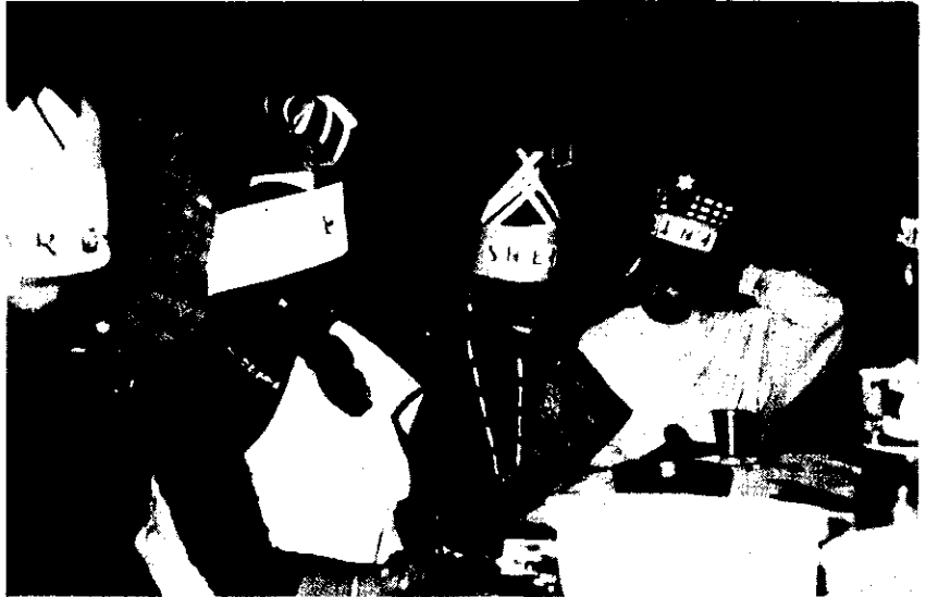
... after everyone was properly attired, the games began ...

GAME : The next game was a numbers game that didn't have anything to do with animals. We counted round the circle and when the number 7 or a multiple came up the person having it could not say it but had to clap instead. This is also harder than it sounds and the first failure was quick. THEN the animal part came in. The "loser" had to be punished by doing whatever the