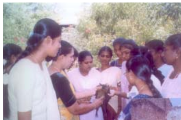
The club members analyzing the threat to the Pteropus giganteus roosting sites at Murappanadu (About 12 kms east of Tirunelveli). People hunt bats for trade.