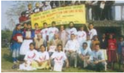
Participants of the rogramme for Introduction and Conservation of Bats, held on 2 February 2004, Venue: Megamix Nature Club office