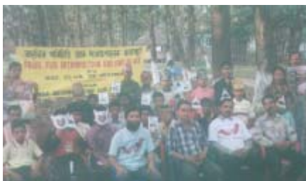
Participants of the rogramme for Introduction and Conservation of Bats, held on 19 February 2004, Venue: Jonai Forest Range Office campus