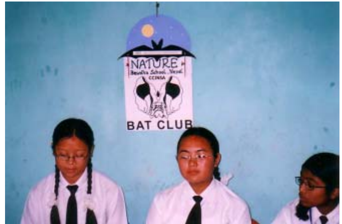
Bat Club members with the CCINSA bat club logo