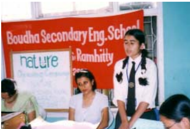
A student explaining how do bats help people

After the interaction, we explained about the bat passport and told members to write meeting notes on their passports.