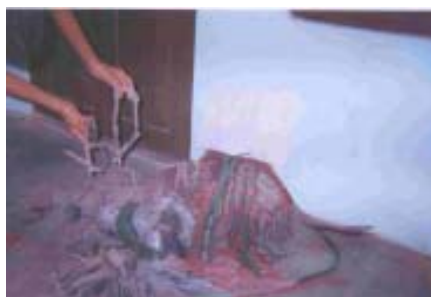
Seized by Bat Club of Megamix -- Devices made of rubber and leather are used to kill small birds and bats seized from Lakhimpore and Dhimaji district in Assam. Sapplins from: Bihar state