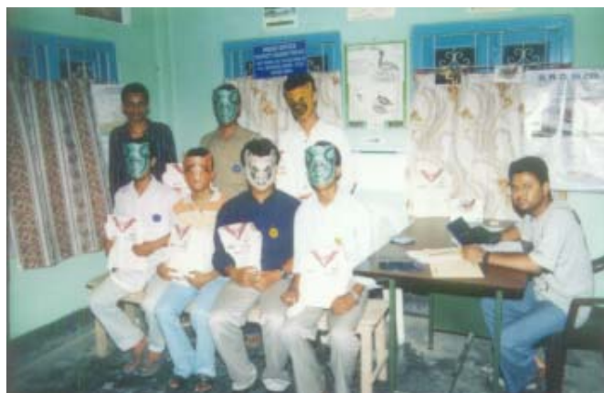
1 st batch of Bat Club with the organisers at BAT Head office during CCINSA Bat Club activities

In the month of January 2004, two different informal meetings were held to choose the right target group within the age of 3-7 years (Kids) and 12-16 years (High School Students). Kids were very much enthusiastic about the programme but they were uncomfortable with the bat agendas. Later we decided to take the second group as BAT was looking for more and more permanent and dependable troop members for future help.