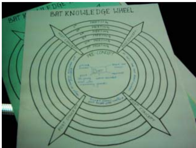
Bat Knowledge Wheel

We had first Bat meeting on Monday 11 th October. It went well. All the kids were very excited and interested. We registered 22 club members. After telling them about NATURE, CCINSA and Zoo Outreach Organisation, we prepared a concept map. I developed a new style of concept map for this bat club because this club has to go for at least 6 meeting so I made 7 circle like wheel, first middle circle is pre concept and other 6 circles are post concepts and indicated as 1 st meeting, 2 nd meeting .....6 th meeting. The members had to write in the 1 st meeting circle what they learned in the first meeting and same as in second to sixth. In this wheel we can see how the knowledge of members about bat developed gradually through the club activities. I have given the name "Bat Knowledge Wheel" for this circle.