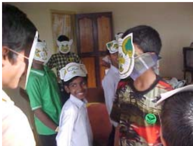
ECHOO... the game