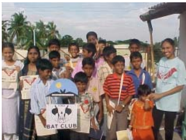
Members on the first day

After registration and becoming a member the coordinator took pass port size photos of all the members for record and also for use in future activities. Issuing bat passport to all members is the main activity of the first day. The coordinator showed a colourful attractive passport issued by the sponsors and explained about it. Before explaining he ensured that everybody got a copy of the passport. He