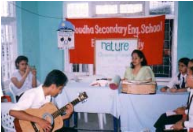
A student singing a song on bats