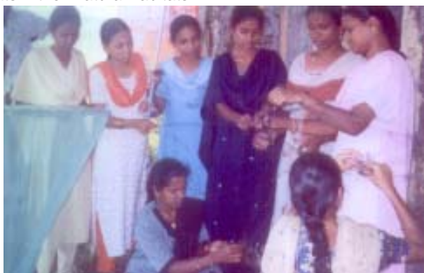
The bat club members capturing Hipposideros speoris with mist to study the closer view of bats, its sent glands and the nature of parasitic infestation of bats with parasites

March 29, 2004 -- Certificates were awarded to all the participants and a report about the bat club members was presented in the valedictory function of the college union. The team is continuing with several ambitious research programs and working out as part of the crusade to save bats in their natural habitats.