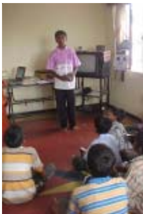
A new member

This special meeting of the KBC was organized to induct new members. There was an overwhelming attraction developed all in a sudden as a result of the propaganda and report given by the members of KBC to their friends and family circle. The KBC members wanted to bring their friends and kin to register as a member of KBC. One of them brought his dad along with him for registration. It was decided to arrange this special meeting to induct new members in to the club and teach them at one stretch and keep them update to the level of the existing members. About six new members registered their names.