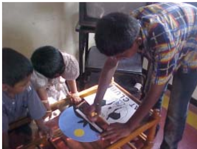
Member preparing name board

The first day of the programme started at 3.30 pm. The organiser welcomed all the members and appreciated their interest for choosing to become a member of the club. He gave an introduction about the club and the objectives of the club. They were also explained about the organizations that involved with this club. The sponsors of this club namely: Chester zoo, Zoo Outreach Organisation and CCINSA were introduced to the members. The organizer after a general introduction discussed about different life forms and the most encountered animal by man – the mammal. After