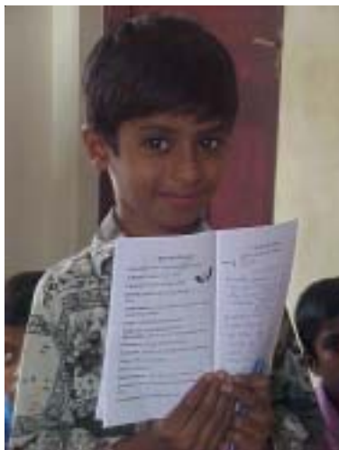
A member with passport

explained all about the passport page by page starting from the logo of the sponsors printed on the front page with a additional information about the institutes and made every body understand how to use the passport. Then they were asked to write their names and fill up the back side of the front cover. He also instructed the members to get a signature from their parents at the front page near the CCINSA seal as a token of agreement by their parents by allowing them to become a club member. He also asked the members to explain to their parents about the club and its objectives and if interested ask the parents to attend one of the meetings.