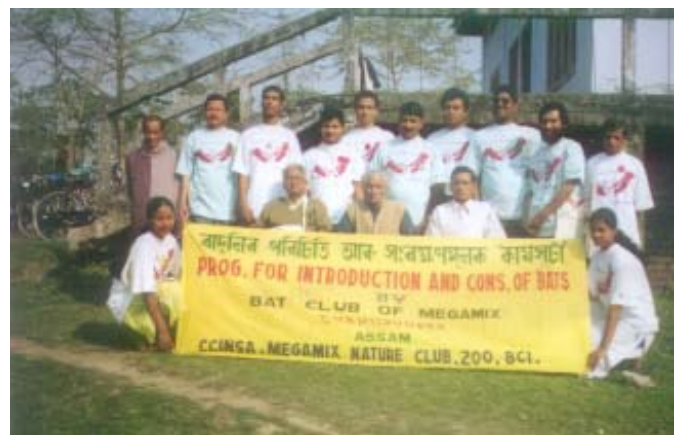
Members of Megamix bat club, Assam