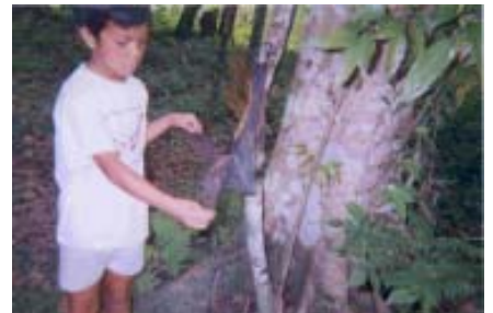
The modhoc is dead (electrocoated) the infant in her breast is alive. Displaced by a member of Bat Club of Megamix, Assam