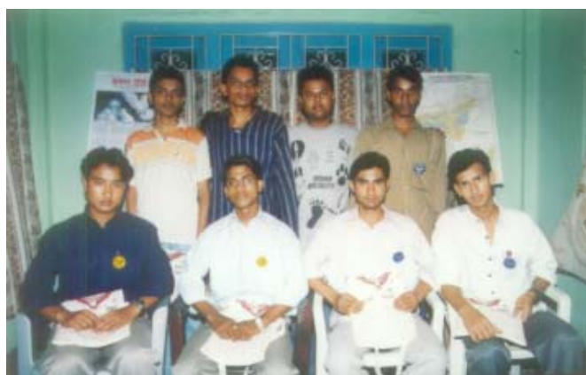
Bat Club members with the organisers

We started the Bat Club with six students from Class X of St. Agastiya High School of Dhubri District, Assam. All are very smart and determined. We organized the first meeting on 1 st of February 2004. Then on 8.2.04 followed by 3 rd on 7.3.04 and 4 th on 21.3.04. We could not organize the 5 th meeting and field trips for financial problems of the Club. Finally on 27.4.04 we organized the last meeting with a little ceremony and a short photo session. At the same time we distributed the certificates signed by the CEO of BAT and was kept inside the brown cover supplied by ZOOS.