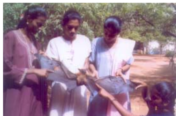
A pathetic site of a wounded flying fox Pteropus giganteus provoked the team members to make and arrangement for a mega bat conservation awareness programme among, the college students