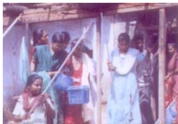
The club members organized marvelous bat conservation field trips to the roosting sites of Hipposideros ater and Hipposideros speoris on 17 November 2003