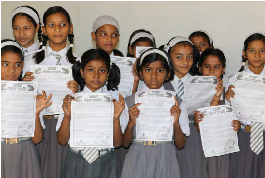
How to instruct or breed frogs at home - Instruction pamphlet