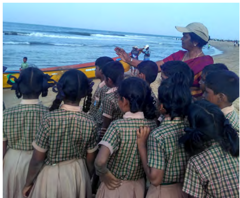
Students at Kovalam beach on field trip

The author addressed the relationship between man and nature and highlighted to admire, to admit and to adore the nature at home, school and in public places. As a coordinator, she gave a brief note on environmental activities follow-up done by the school for a year. The participants took an oath on saving environment and they all received saplings. The tree plantation was done at the campus by the chief guests and others.