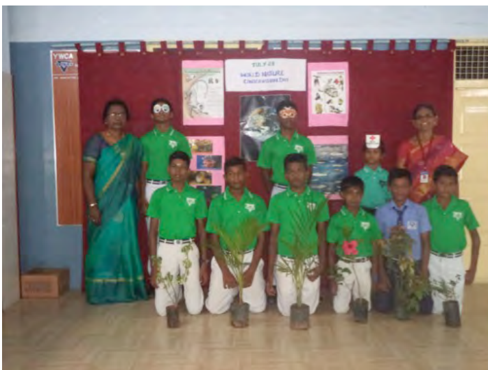
Students donating tree saplings for the school