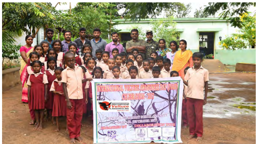
Rally attracted public attention