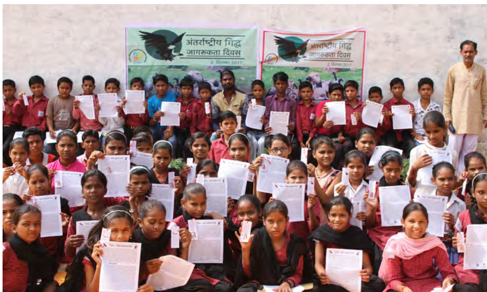
Participation of students in vulture conservation awareness initiatives

schools away from vulture sites. Effective conservation aims to combine, rather than struggle with, the needs of the human communities that share landscapes with biological communities. Therefore, effective outreach programs headed to address knowledge about the vulture's habitat needs as well as the value of conserving the animal and its habitat to support human needs. People were also motivated to participate. They like feeling needed and that they can make a difference.