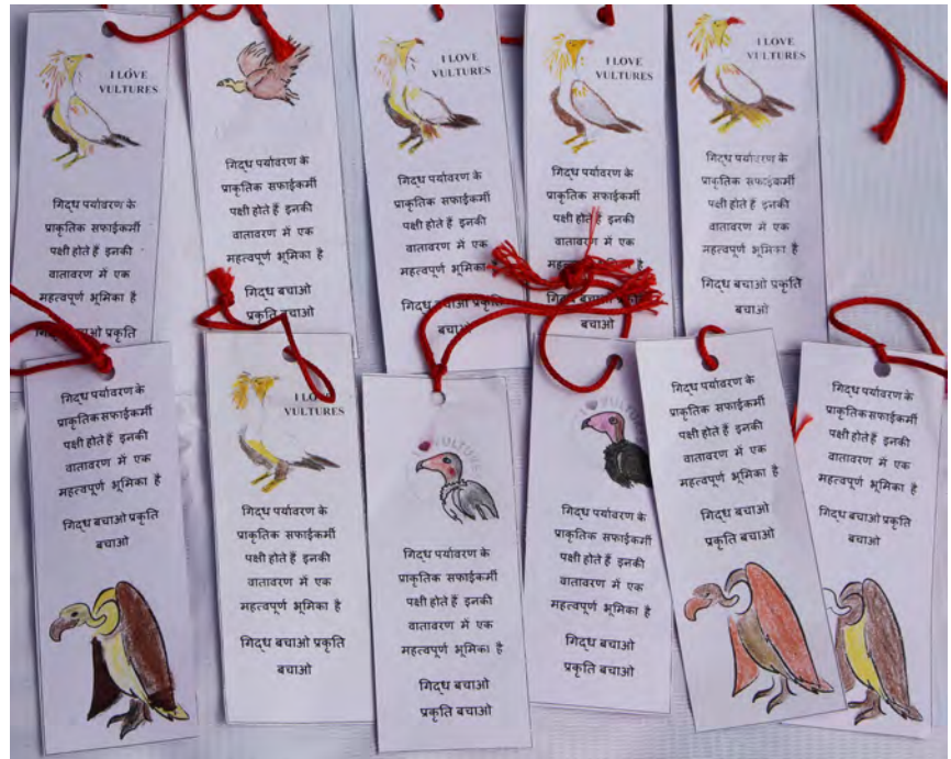
Bookmarks prepared by the student

There are several natural habitats of vultures in Uttar Pradesh and Madhya Pradesh of India. The rational conservational approach seeks to involve the population dwelling near the natural habitats of vultures. So the focus of this year IVAD was on schools and villages in close proximity of vulture habitats. The students participated in various activities such as painting, preparing bookmarks and pebble art (as paper weights), all based on vultures. The students gifted the handmade paper weights to their teachers on Teacher's Day. The students also helped in sticking the wall posters on vultures in their schools and neighborhood. Awareness initiatives were also taken in