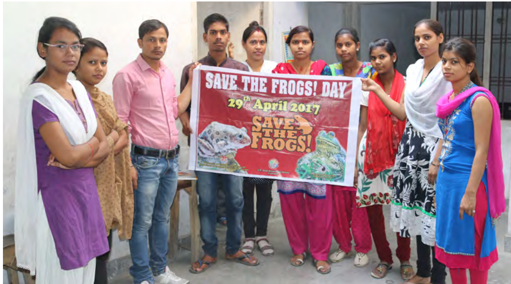
Awareness amongst students of various colleges in District Lucknow