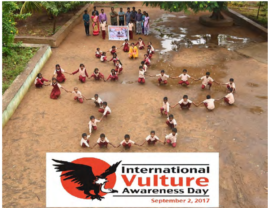
Students formed vulture chain to attract public