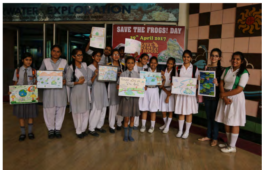
Participants taking parts in poster competition

Like every year this year also students from different schools and colleges of Lucknow have been invited to take part in the events like poster, power point presentation and quiz competition based on frogs and amphibians.