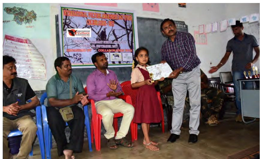
Winners receive prize as a token of appreciation from the organisers