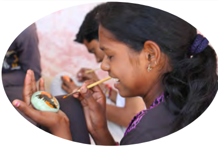
Students preparing paperweights through pebble art