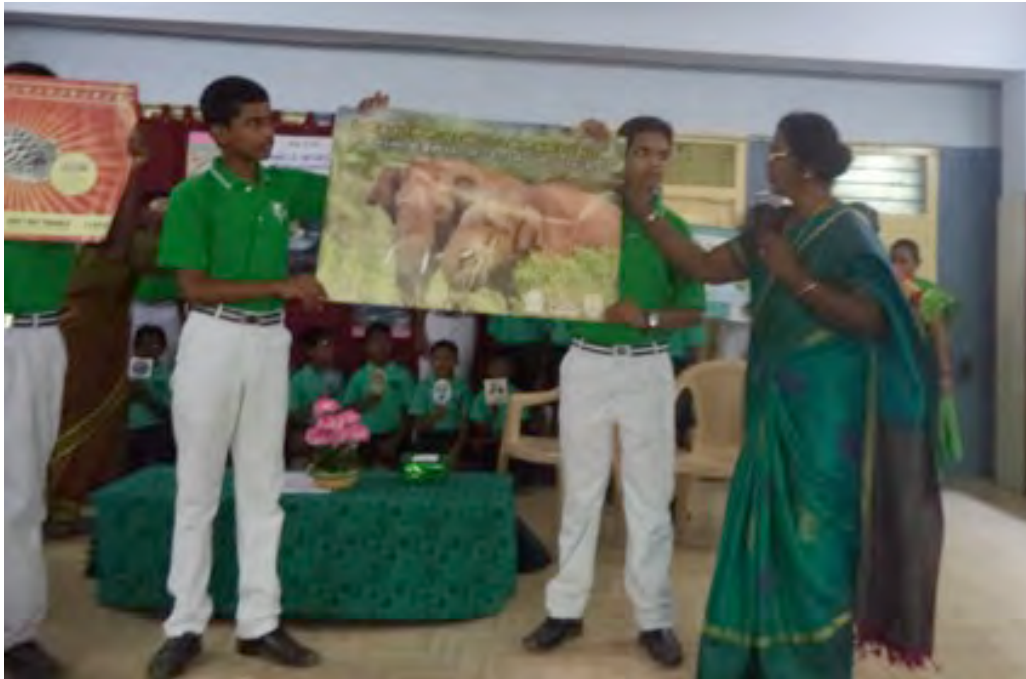
Promoting Human elephant coexistence through poster reading