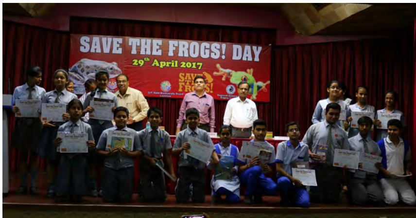
Group photographs with the winners of competitions

On the occasion of Save the Frogs Day a mass awareness campaign was organised from, 27-28 April in which a mass awareness car has been flagged off, University of Lucknow with Volunteers of Biodiversity and Wildlife Conservation Lab, to create awareness regarding conservation of frogs and amphibians. Around 200 schools and a large number of common people were benefited. Aim of mass awareness was to brief about