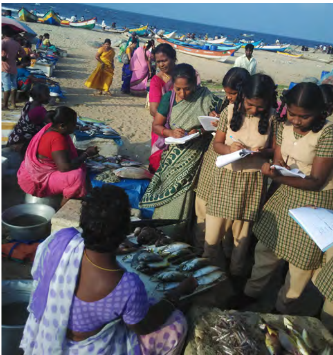
Understanding marine diversity in the field