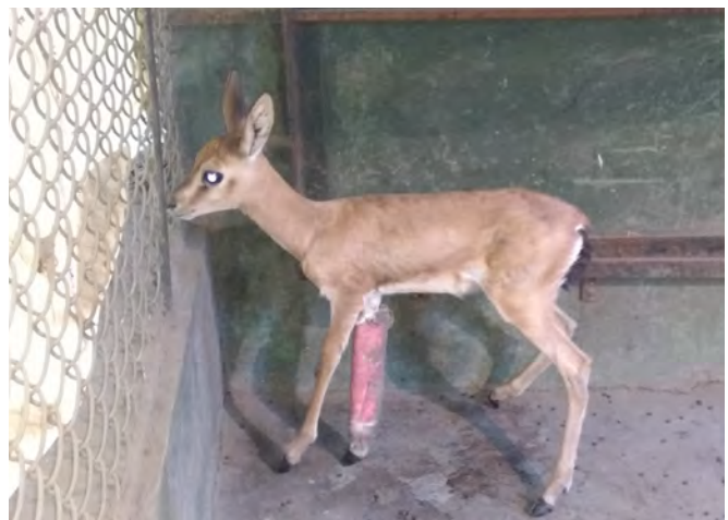
External immobilization with bamboo stick splint & plaster of paris bandage Bone)

Animal tolerated the bandage and bamboo splints. After one and half month post-operative radiological examination was carried out. It revealed that