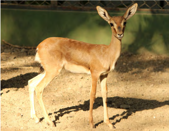
Animal after complete recovery

fracture bone was healed properly with callus formation.