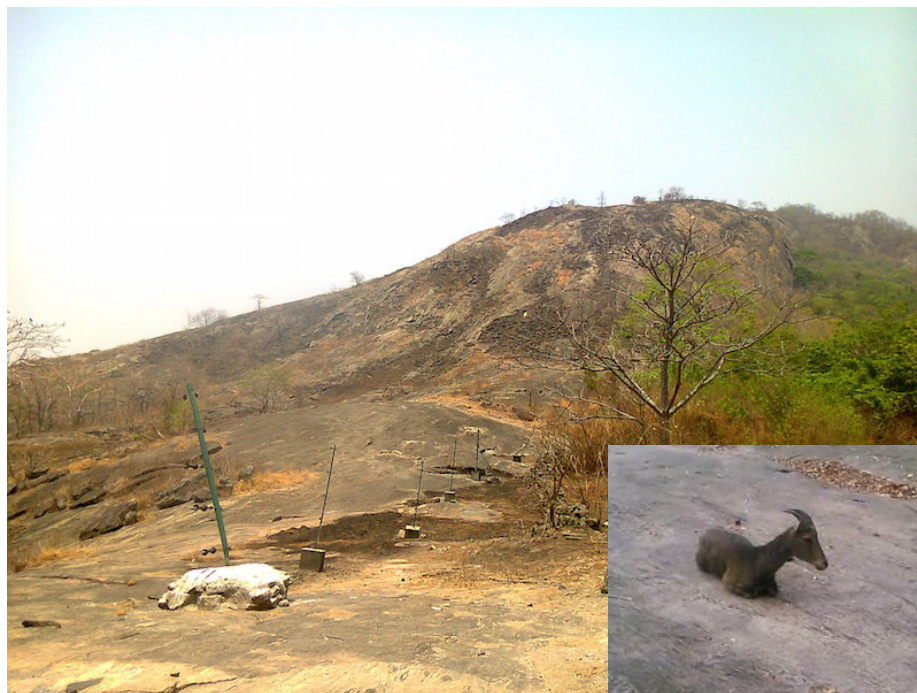
Release site of Nilgiri Tahr (Inset image: Nilgiri Tahr after release)

Multiple sites near Walayar hills were searched to release the animal. Two locations were found suitable for Tahr i.e. Kuppalan Challa (10.818889°N & 76.747156°E) and Kottamutti (10.828210°N & 76.781646°E) of which the latter was discarded due to the