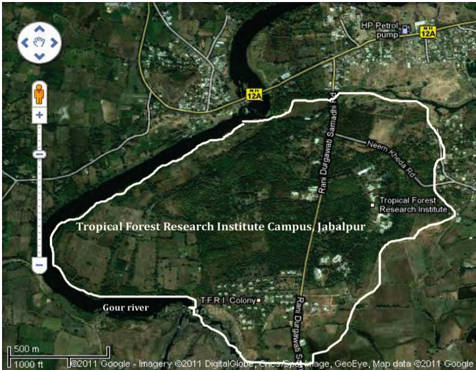
Google Map of Tropical Forest Research Institute Campus, Jabalpur

campus are provided shelter to number of wild animals. The campus is surrounded by agricultural field with rural inhabitation. The water reservoir and the vegetation planted around the institute have created a very good habitat and source of attraction for many faunal species like insects, amphibians, reptiles,