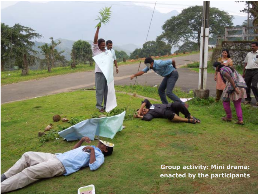
Group activity: Mini drama: enacted by the participants

The objective of the workshops was to educate all the people living in or near elephant habitats of Palakkad, Wayanad and Chalakkudi districts in Kerala, South India to improve their attitudes towards wild elephants so as to avoid confrontation and conflict whenever possible.