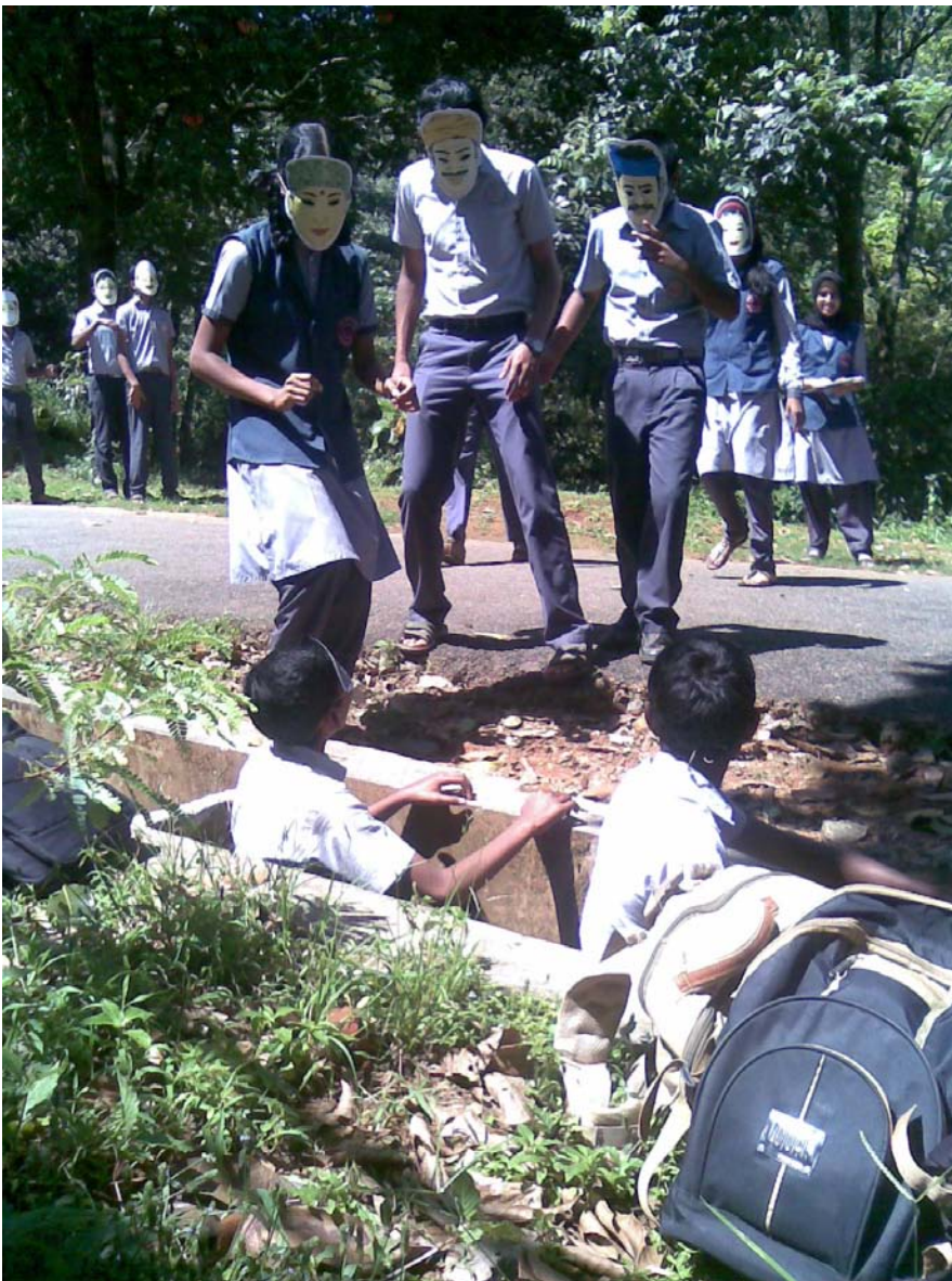
Mini drama enacted by students as part of the awareness programme conducted by the Trainees of the Educators Training programme

and at Silent Valley Model Residential School 100 girl students participated and another 120 students remained as observers.