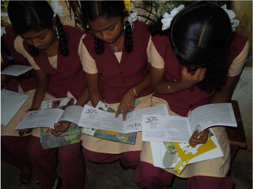
Students learning about elephants from the booklet which is a part of teaching/ learning materials on HECx