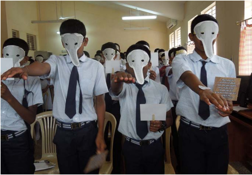
Students taking pledge on HECx