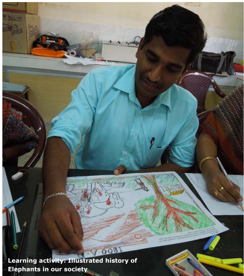
Learning activity: Illustrated history of Elephants in our society