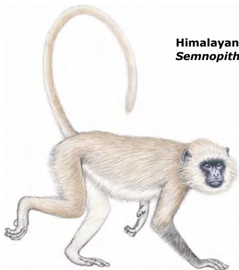
Himalayan Grey Langur Semnopithecus ajax

Membership in the Alliance is open to any non-governmental environmental organization that has as a primary purpose the conservation of biological diversity. Zoos should consider taking membership in AZE – it is a “win-win” for zoos. The AZE method is a natural for selection of conservation projects undertaken by zoos, which are changing the image and meaning of zoos. Moreover the data collected through supporting project will add to the global database.