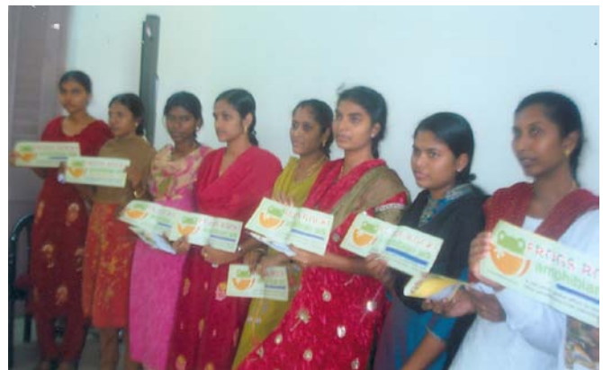
Spare your car bumper to save frogs: Teacher trainers with amphibian bumper stickers.

Before the teacher – trainees left for practice teaching to various schools, the college has taken much effort to give input to them in order to equip them properly. The importance of ozone, its structure, distribution etc. have been recapitulated since the participants have already studied in schools and colleges. Interactions were there about the present situations. But when they heard that many voluntary organizations had joined together to repeat the slogan on 01 January 2010 --- The Sun rises in the East .... The CFCs & HCFCs set in the west .... Everybody likes to repeat the same and listed out the day today substances they use which are harmful and the agents to deplete the ozone layer. They themselves decided to practice ..... Refuse, Reuse, Reduce and Recycle.