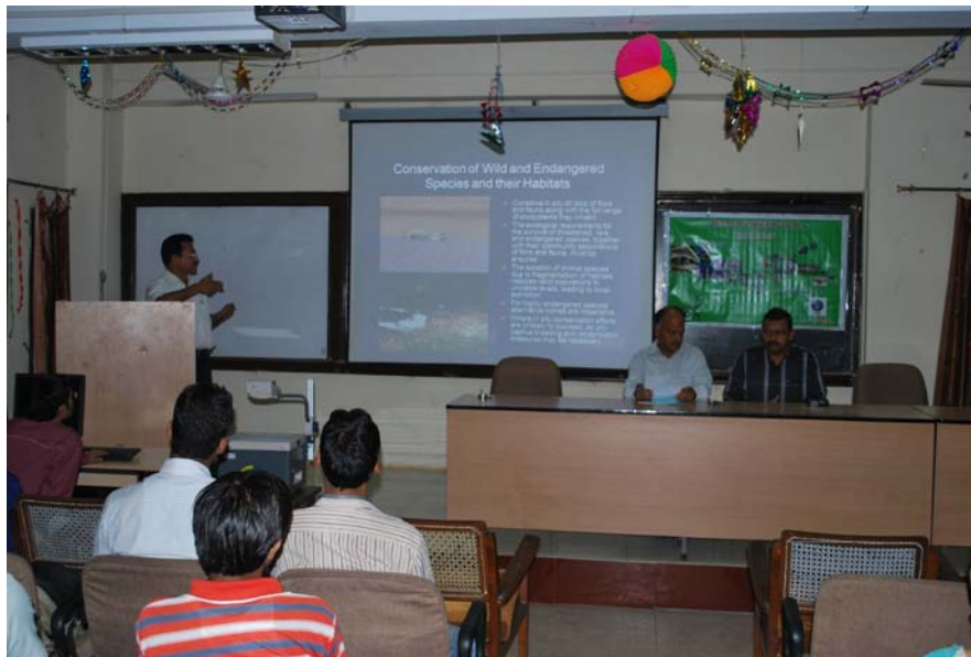
Group discussions, special lectures on wildlife conservation during wildlife week at Jiwaji University