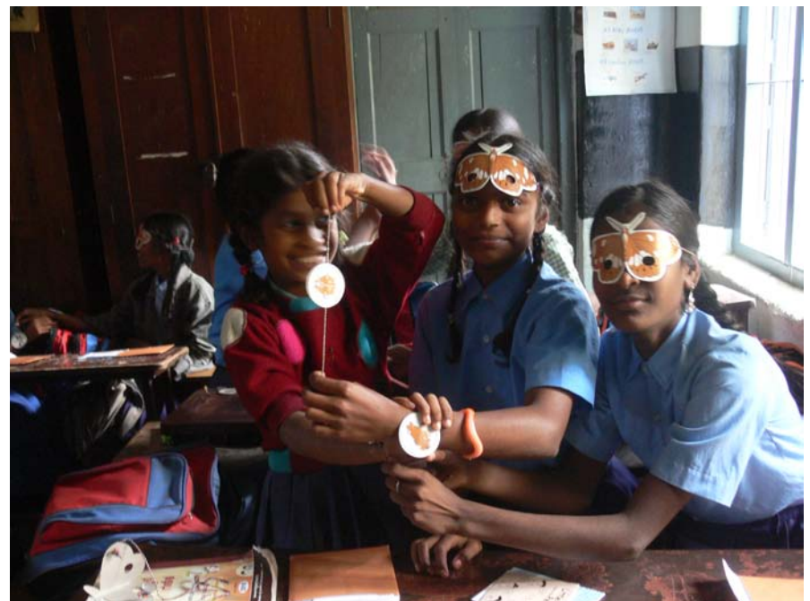
Students are happy wearing masks and taking oath to save wildlife

Each one got 'Daily Life Wildlife', and very enthusiastically they went through the packet. They were told how to use it. They were asked to take a pledge of 'learning more about wildlife' and tie rakhi to each other, and wore mask and felt happy about it.