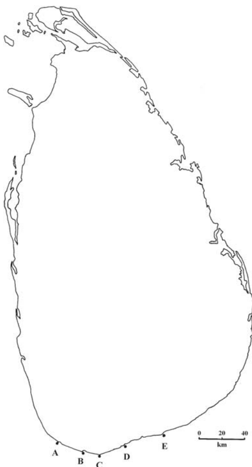
Figure 1. Map of Sri Lanka, showing the five sampling sites. A - Galle; B - Weligama; C - Matara; D - Tangalle; E - Hambantota