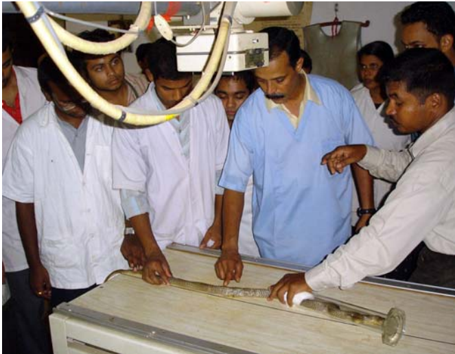
Image 1. The depressed area in the mid-dorsum

Main article in Zoos' Print Journal 22(6): 2735-2736; Manuscript 1691; ©Zoo Outreach Organisation; www.zoosprint.org