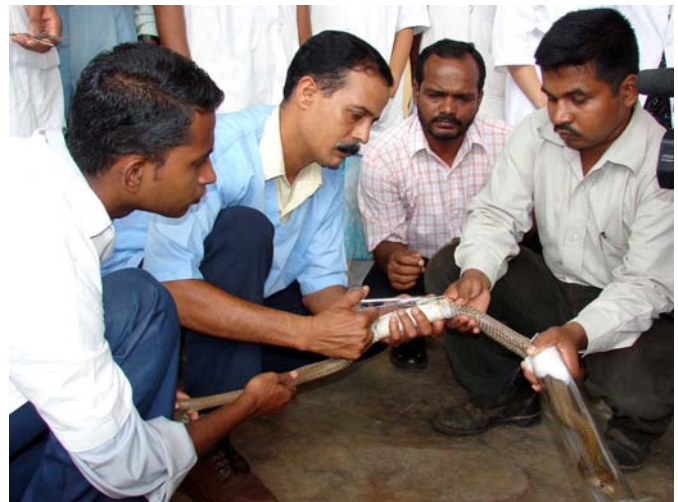
Image 4. Removal of splint