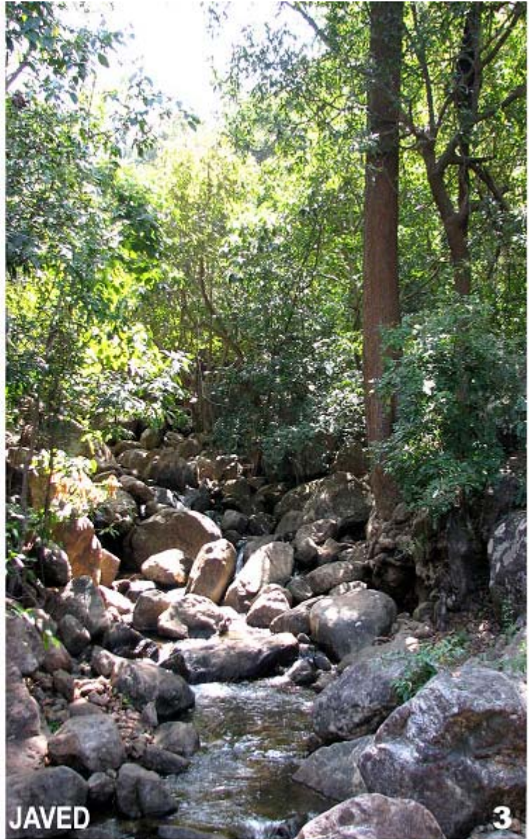
Images 1-3. Different habitats of Golden Gecko at Perantalpally, Papikonda Hills, Andhra Pradesh