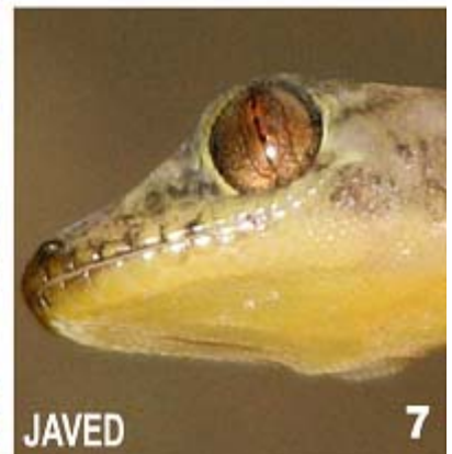
Images 4-7. 4 - Golden Gecko Calodactylodes aureus Beddome, 1870 adult male on the boulder; 5 - Dorsal aspect of Golden Gecko showing distinct head; 6 - Lateral aspect of head region of Golden Gecko showing vertical pupil & ear opening; 7 - Lateral aspect of mouth region of Golden Gecko showing 12 upper & lower labials