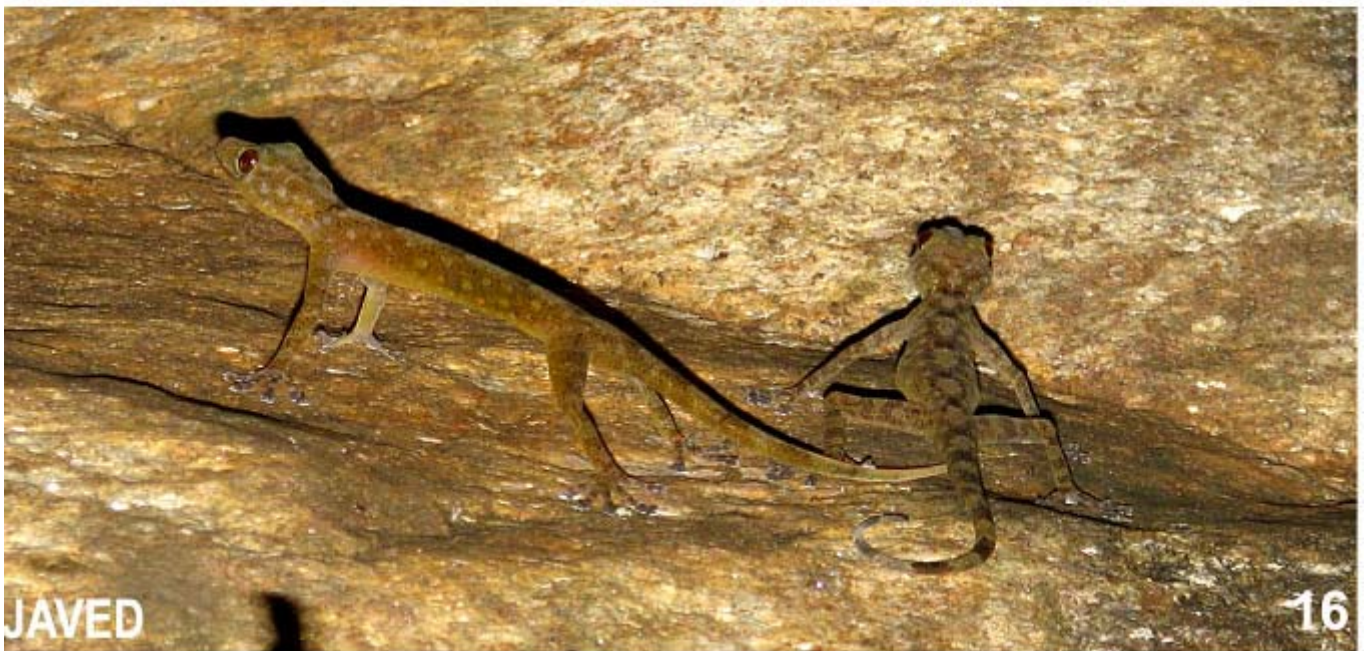
Images 14-16. 14 - Ventral aspect of trunk of Golden Gecko; 15 - Egg site showing Golden Gecko egg cluster on the roof of the boulder; 16 - Territorial display between adult Golden Geckos, showing the arch position