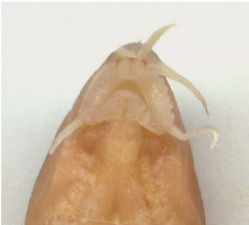
a. Nemacheilus anguilla