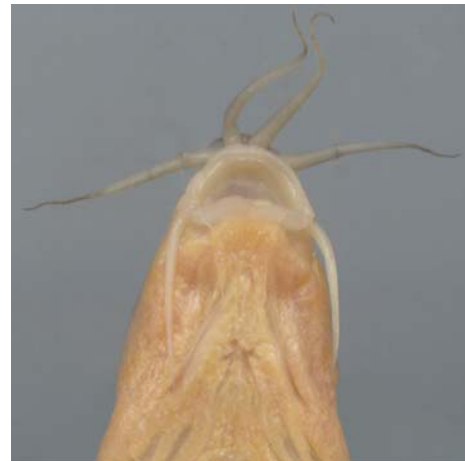
a. Nemacheilus monilis