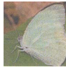
Catopsilia pyranthe pyranthe Linnaeus Family: Pieridae