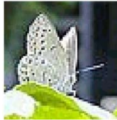
Pseudozizeeria maha Kollar Family: Lycaenidae