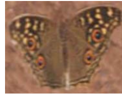
Junonia lemonias lemonias Linnaeus Family: Nymphalidae