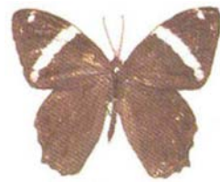
Lethe confusa aurivillius Fabricus Family: Satyridae