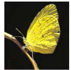
Terias brigitta rubella Stoll Family: Pieridae