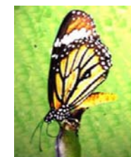
Danaus genutia genutia Family: Danaidae