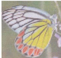
Delias eucharis Drury Family: Pieridae