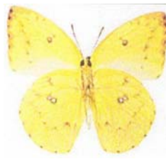
Catopsilia pomona Fabricus Family: Pieridae