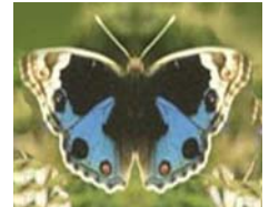
Junonia orithya Linnaeus Family: Nymphalidae