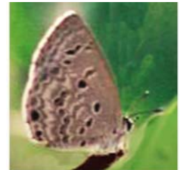
Chilades laius Stoll Family: Lycaenidae