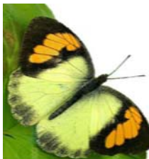
Ixia pyrene sesia Fabricus Family: Pieridae