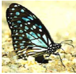
Tirumala limniace Cramer Family: Danaidae