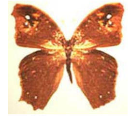
Melanitis phedima bela Moore Family: Satyridae