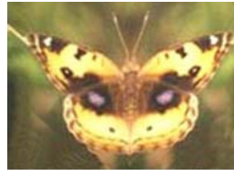
Junonia hierta hierta Fabricus Family: Nymphalidae