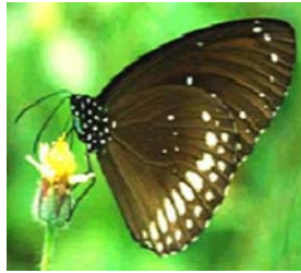
Euploea core core Cramer Family: Danaidae