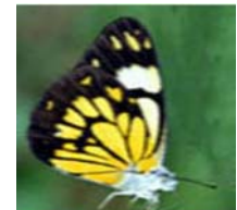
Belenois aurota aurota Fabricus Family: Pieridae