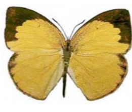
Terias laeta laeta Boisduval Family: Pieridae