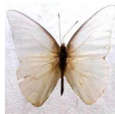
Appias albina Boisduval Family: Pieridae