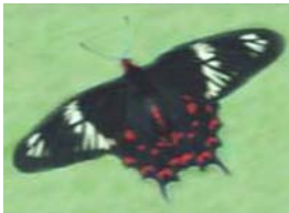
Pachilopta hector Linnaeus Family: Papilionidae