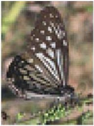
Parantica aglea aglea Stoll Family: Danaidae