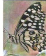
Papilio demoleus demoleus Linnaeus Family: Papilionidae