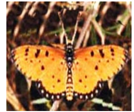
Acraea terpsicore Linnaeus Family: Nymphalidae