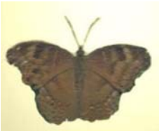
Precis iphita iphita Cramer Family: Nymphalidae