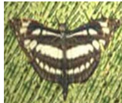
Neptis hylas Linnaeus Family: Nymphalidae