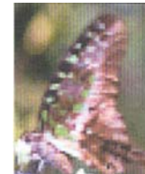
Graphium agamemnon menides Felder & Felder Family: Papilionidae