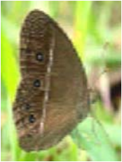
Mycalesis perseus tabitha Fabricus Family: Satyridae