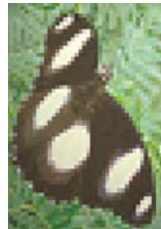
Hypolimnas misippus Linnaeus Family: Nymphalidae