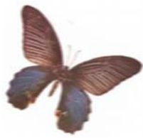
Papilio protenor protenor Cramer Family: Papilionidae