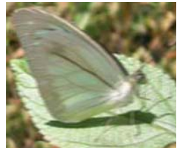
Pareronia valeria Cramer Family: Pieridae