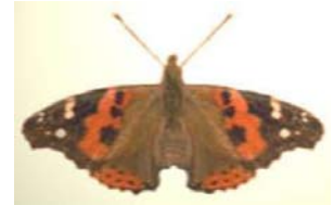
Cynthia cardui Linnaeus Family: Nymphalidae