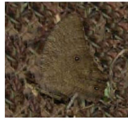
Melanitis leda leda Linnaeus Family: Satyridae