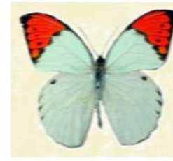
Hebomoia glaucippe Linnaeus Family: Pieridae