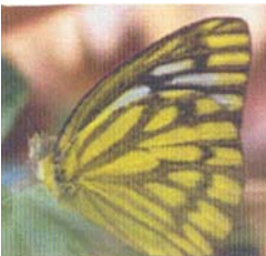
Cepora nerissa nerissa Fabricus Family: Pieridae