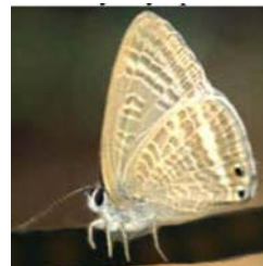
Euchrysops cnejus Fabricus Family: Lycaenidae