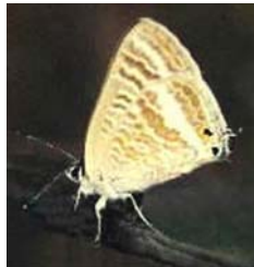
Lampides boeticus Linnaeus Family: Lycaenidae