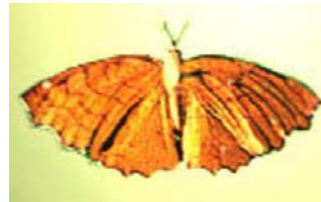
Ariadne ariadne Linnaeus Family: Nymphalidae