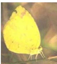
Terias hecabe simulata Moore Family: Pieridae