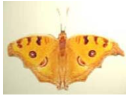
Junonia almana almana Linnaeus Family: Nymphalidae