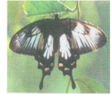
Pachilopta jophon pandiyana Moore Family: Papilionidae