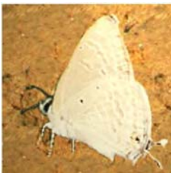
Catochryops strabo Fabricus Family: Lycaenidae