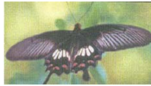
Pachilopta aristolochiae aristolochiae Fabricus Family: Papilionidae