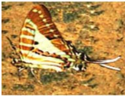
Papithysa nomius nomius Esper Family: Papilionidae

Main article in Zoos' Print Journal 22(7): 2762-2764; Manuscript 1479; ©Zoo Outreach Organisation; www.zoosprint.org