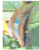
Graphium sarpedon teredon Felde & Felder Family: Papilionidae