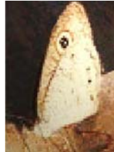
Ypthima huebneri Kirby Family: Satyridae