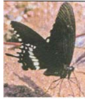
Papilio polytes romulus Cramer Family: Papilionidae