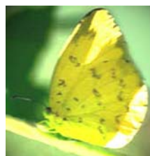
Terias blanda silhetana Wallace Family: Pieridae