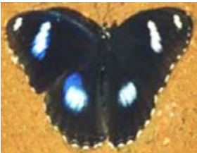
Hypolimnas bolina Linnaeus Family: Nymphalidae