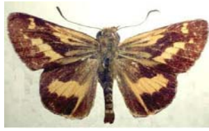
Telicola ancilla Marbille Family: Hesperidae