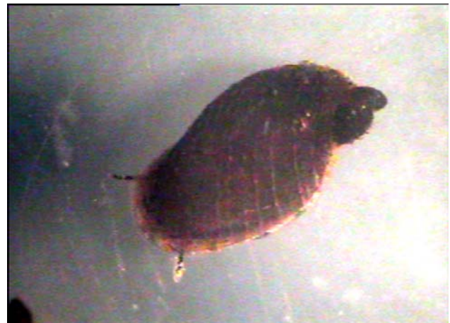
Images 5 & 6. Mature Camptoceras lineatum in life