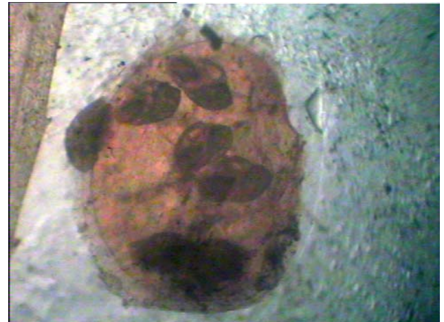
Image 4. Camptoceras lineatum outside the egg sac just after hatching (120 hours)