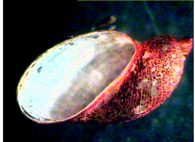
Image 2. Ventral view of a Camptoceras lineatum shell.