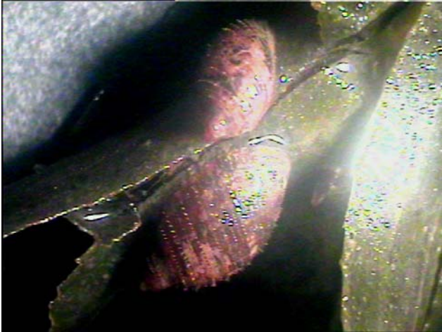
Image 1. Two Camptoceras lineatum on their host plant

Main article in Zoos' Print Journal 22(12): 2916-2919; Manuscript 1558; ©Zoo Outreach Organisation; www.zoosprint.org