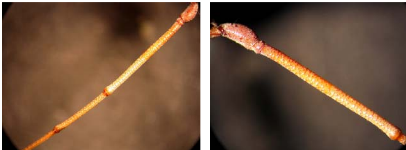
Images 4 & 5. Antennal segments 1 to 4 in male O. anogeissi - Note asperate nature.