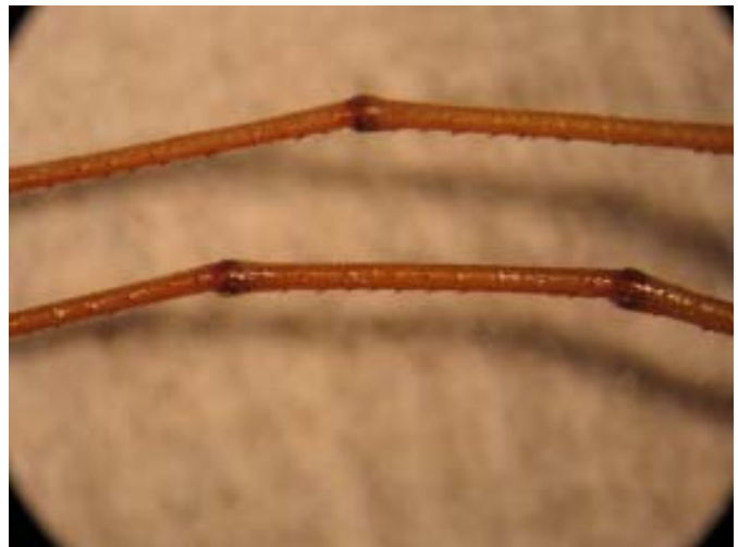
Image 3. Ventral spinules on the antennomeres of O. bilobus.