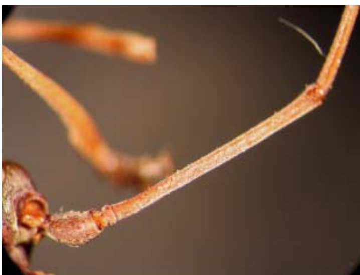
Image 6. Antennal segments 1 to 4 in female O. anogeissi - Note relatively very smooth nature