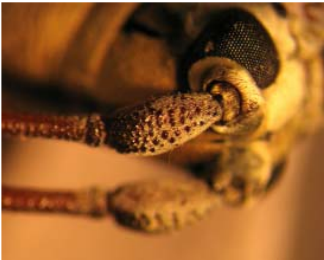
Image 2. First antennal segment in male O. bilobus - Note dorsal asperities.