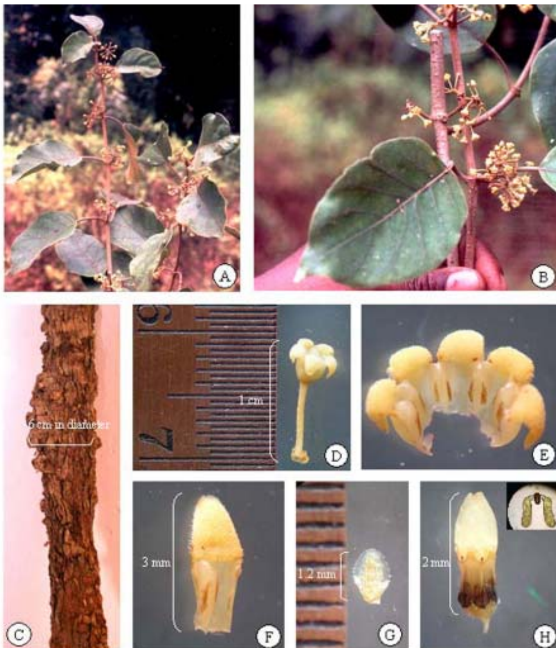
Image 1. Gymnema khandalense Santapau A - Habit; B - Inflorescence; C - Bark; D - Flower; E - Corolla split open; F - Petal; G - Sepal; H - Gynostegium (inset: pollinia)

Main article in Zoos' Print Journal 19(9): 1623-1624; Manuscript 1179; © Zoo Outreach Organisation; www.zoosprint.org