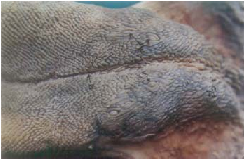
Image 2. Caudal half of the dorsum of tongue of white Bengal Tiger showing filiform papillae (F) at the root, median groove (M) and circumvallate papillae (V).